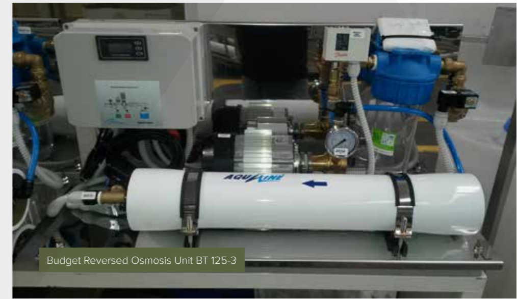
Budget Reversed Osmosis Unit BT 125-3