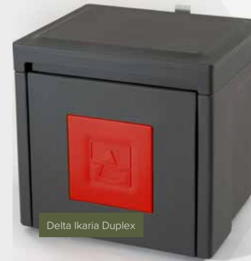
Delta Ikaria Duplex