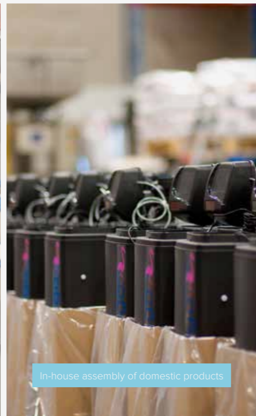
In-house assembly of domestic products