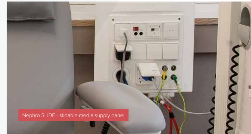
Nephro SLIDE - slidable media supply panel