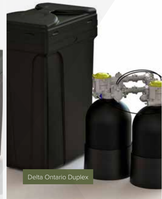
Delta Ontario Duplex