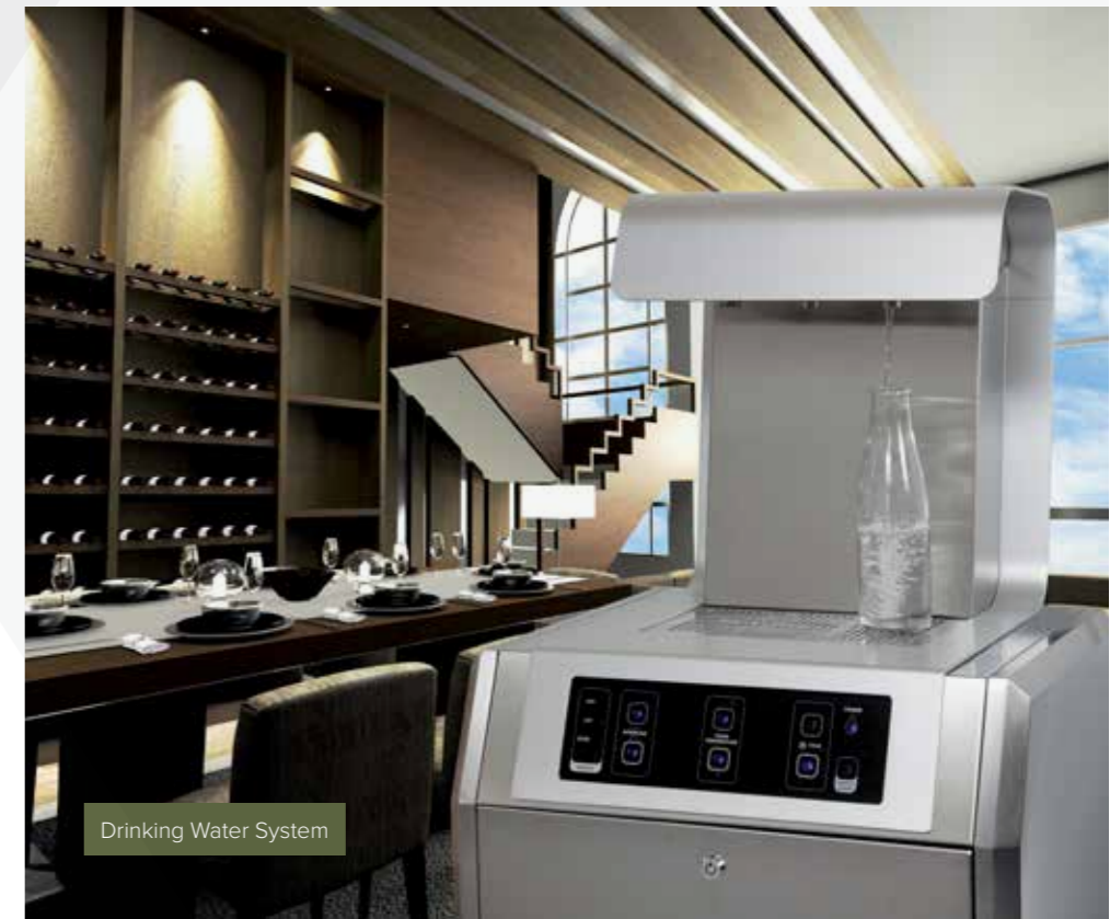
Drinking Water System