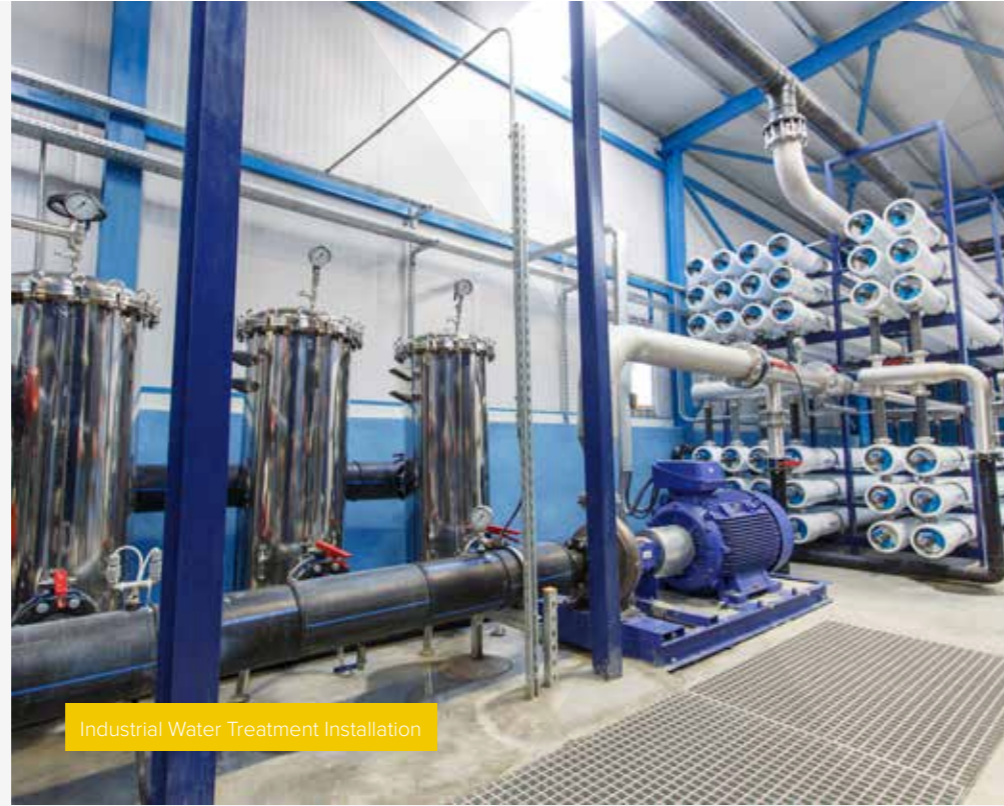
Industrial Water Treatment Installation