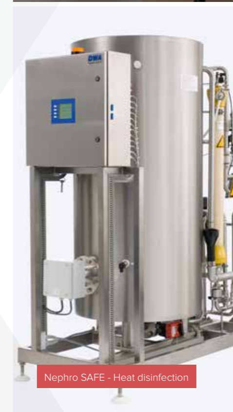
Nephro SAFE - Heat disinfection