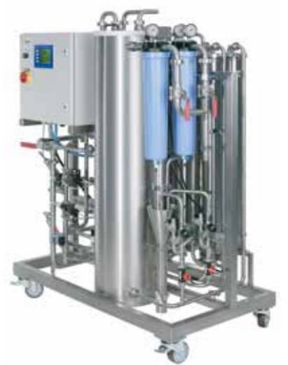
Modula S-XL - Reverse Osmosis System for high permeate flows and operational safety