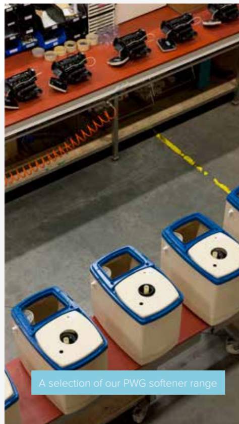
A selection of our PWG softener range