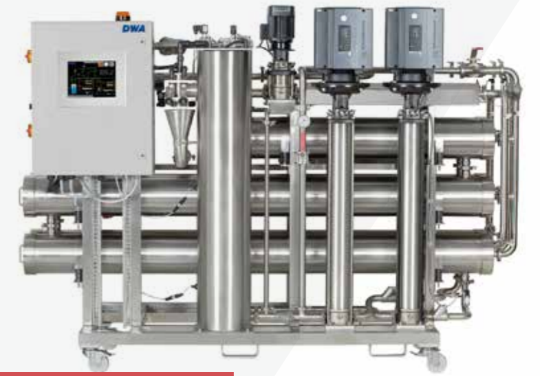
NephRO TP - Twin-pass reverse osmosis