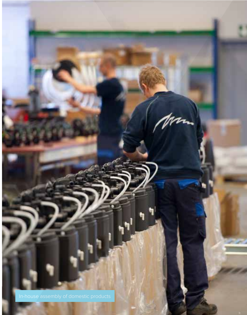
In-house assembly of domestic products